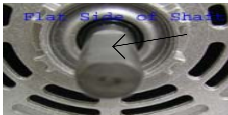
Figure 6 – Motor Shaft