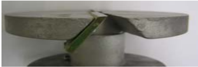
Figure 4 – Fine Setting