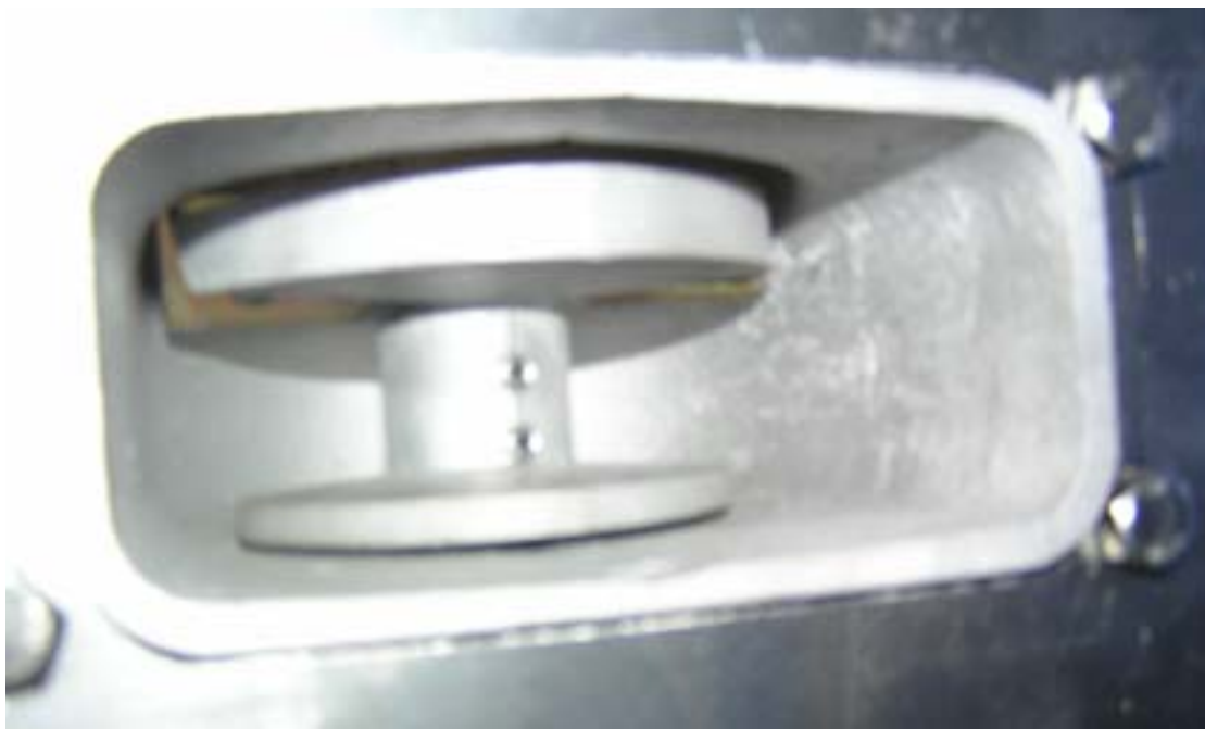
Figure 3 – View through Chute from inside of machine looking up