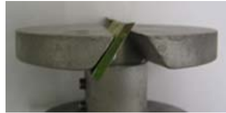
Figure 5 – Coarse Setting